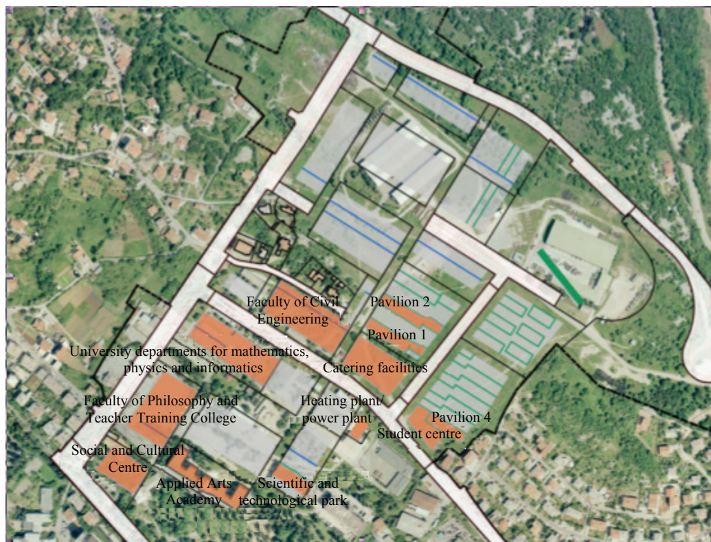
Figure 1. Area of the University Campus of Rijeka and buildings included in Phase One of construction