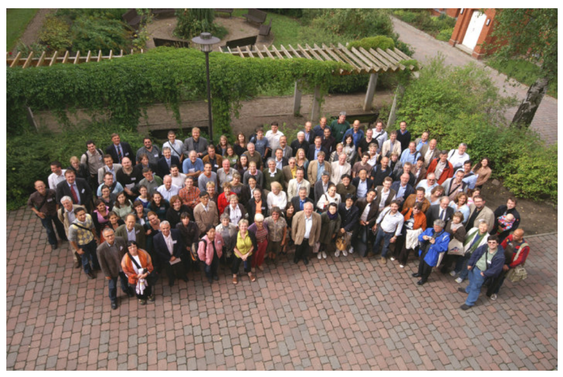
Greifswald conference photo