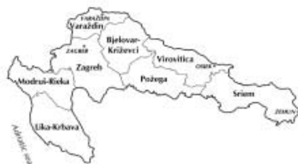
Figure 1. Map of the Kingdom of Croatia and Slavonia around 1918, with names and borders of the counties.

The socio-economic situation was assessed with respect to the growth of number of industry workers as a sign of industrialization, average worker's salary, rooms per capita as a sign of the housing situation, and the growth in number of health insurance treasury funds for workers. Organization of the health service was analyzed on the basis of the number of physicians, pharmacists, and midwives per 100,000 inhabitants, number of beds per hospital, number of physicians per hospital, number of hospitals per 100,000 inhabitants, number of deaths of tuberculosis diagnosed by a physician, and number of those who were treated by physician per 100 deaths.