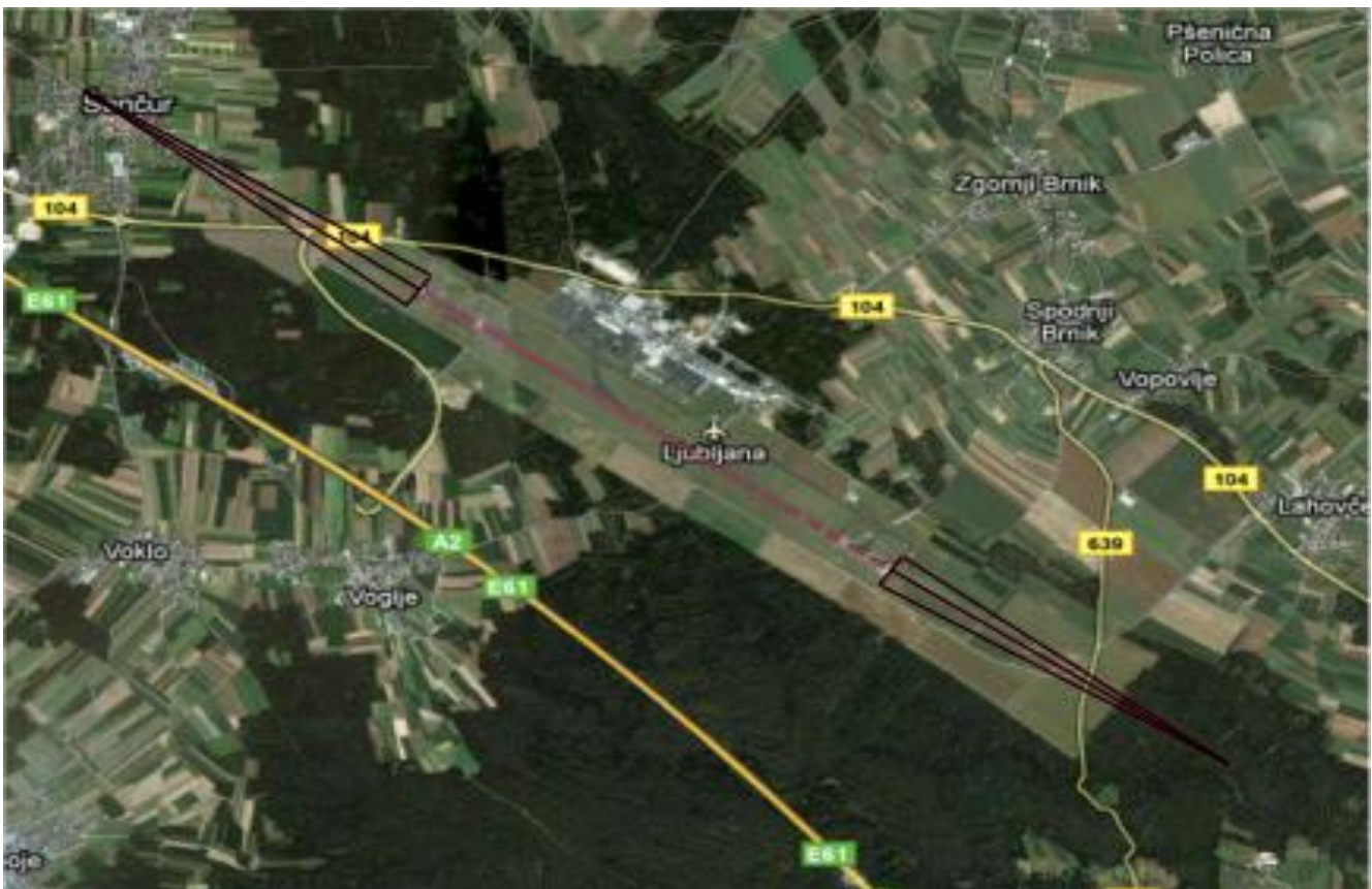
Figure 5: Contours of individual risk for Ljubljana airport

The public safety zone is without the objects but with trees in the first third in the direction of approach. In take-off direction northwest inside the public safety zone there is a certain amount of individual residential objects in the village of Senčur which is situated 1km from the end of the runway and further up to the end of zone. Within the public safety zone there are roads.