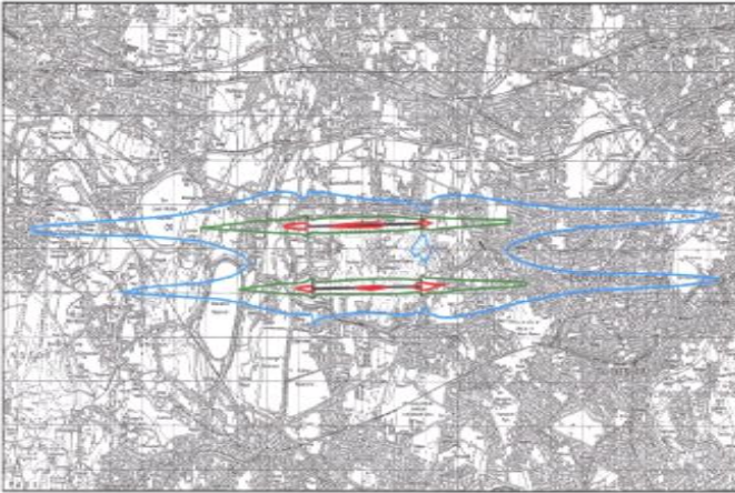
Figure 4: Public safety zone contours of Heathrow airport [4]