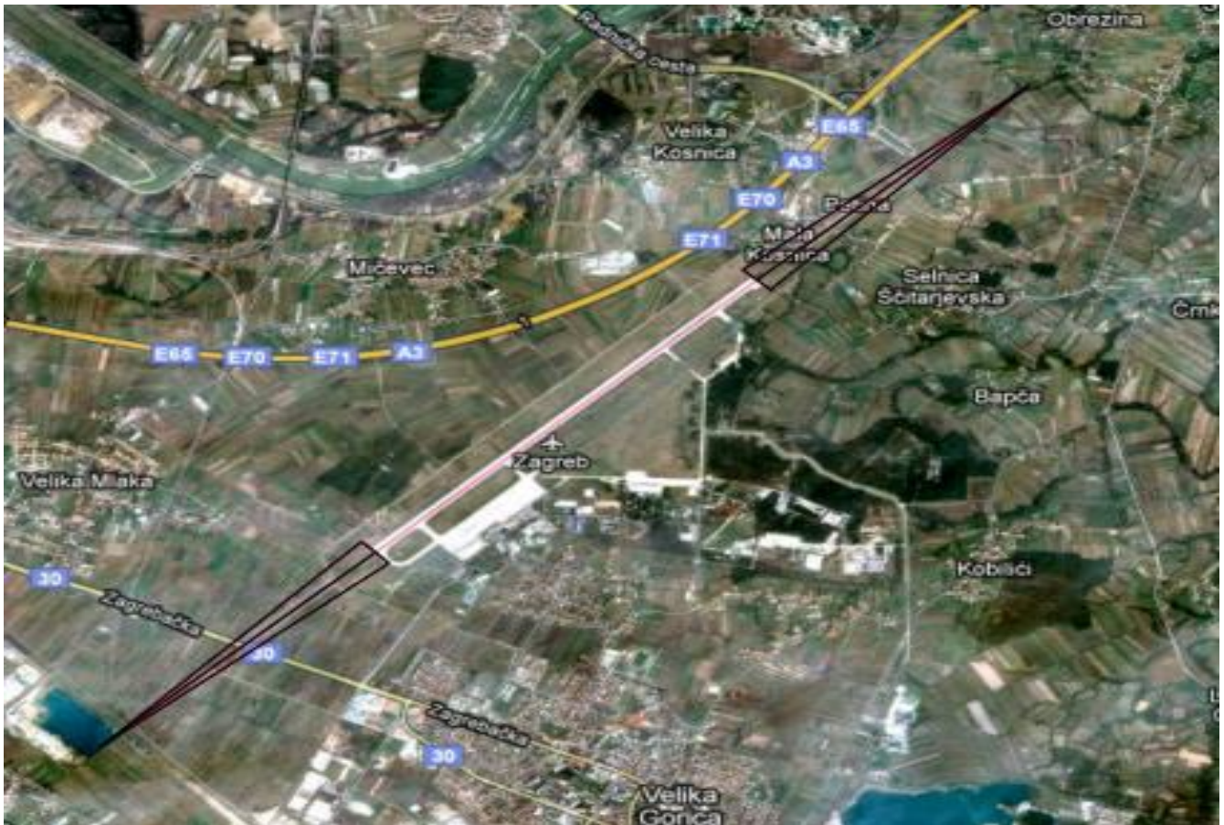
Figure 6: Contours of individual risk for Zagreb airport

Most aircraft accidents happen during take-off and landing in the vicinity of airports and they represent a kind of risk for population on the ground. The analysis of aircraft accidents has proved that the risk increases approaching the runway threshold. Based on this analysis in the 1950s some western European countries produced the first study of risk assessment to third parties on the ground. The result is the construction of public safety zones which are shown in the form of individual risk contours in the figures.