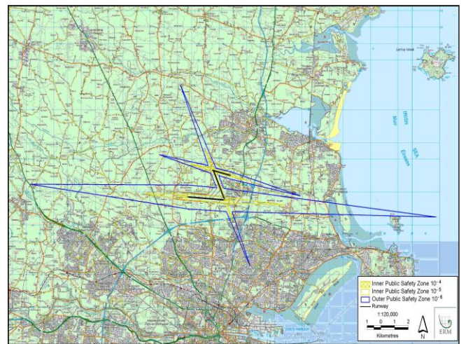
Figure 3: Proposed public safety zone for the Dublin airport runway [6]

Certain changes are introduced, public safety zones take a triangle form with a few contours of individual risk (most often three 10^{-4} , 10^{-5} , 10^{-6} ). Each contour represents an area in which a person resides in a period of one year is subject to certain risk of death. Their construction is based on the following models: crash frequency model, crash location model and crash consequence model. The base of the triangle is at the end of the runway and it is set symmetric with respect to an extended focal point. The base of this public safety zone consists of individual risk contour 10^{-4} and it represents the area with the highest risk of death. The airport with a public safety zone in the form of a triangle is shown in Figure 3.