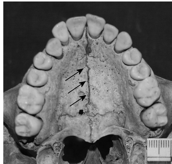
Fig. 2. Open median palatine suture