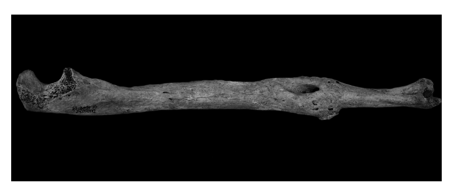
Fig 2. 'Parry' fracture of the left ulna. Grave 166G, male, 36–40 years.