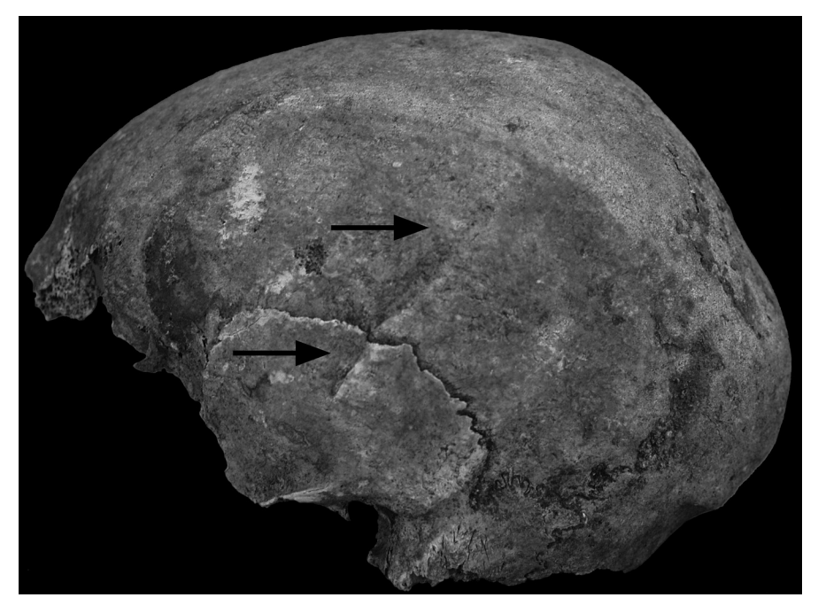
Fig 5. Antemortem sword cut on the left parietal bone and the left temporal bone. Grave 8D, male, 56–60 years.