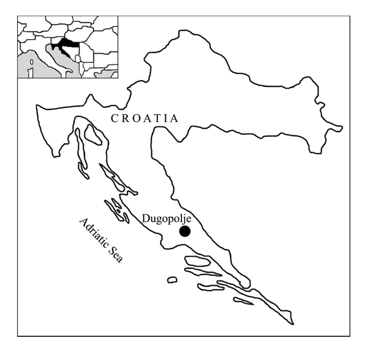
Fig 1. Map of Croatia with geographical location of Dugopolje.

Only adult skeletons (over 15 years of age) were analysed. Sex and age at death were determined based on methods described by Buikstra & Ubelaker (1994). Adults were grouped into three composite age categories: "young" (between 15 and 30 years), "middle" (between 31 and 45 years), and "old" (45+ years).