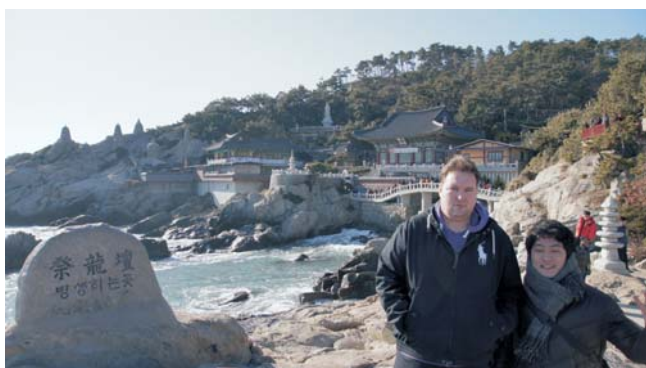
Snapshot from sightseeing

Mountain and most colleges and departments are located there. Other campuses have special objectives and are dislocated from the main one. The campus located in Ami-dong, Busan, is for the department of dentistry, and the campus in the Yang-san city (other city) is specialized for medical sciences. Within this campus there is the Pusan National University hospital. The last one, the Mil-yang city (also another city) campus is specialized for nano- and bio-technology.