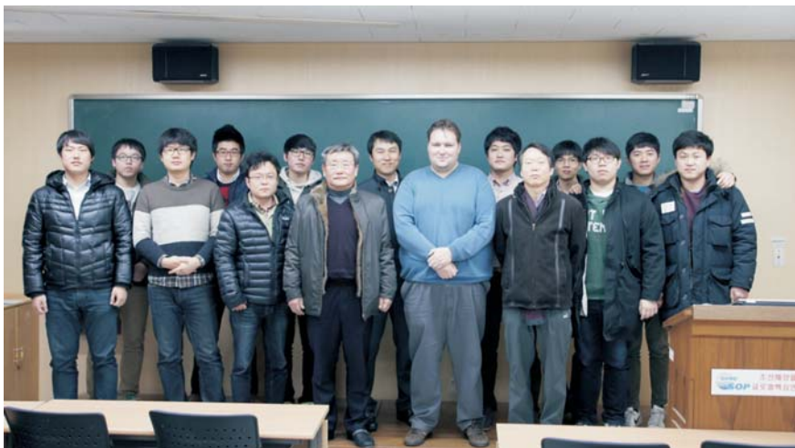
The authors with their colleagues at the PNU

Zavod za brodogradnju i pomorsku tehniku PNU osnovan je 1950. godine, a pod današnjim imenom i trenutnom organizacijskom strukturom funkcionira od 2003. godine. Zavod godišnje upisuje osamdesetak studenata čija stopa zapošljavanja nakon studija je izrazito velika, prvenstveno zbog naglašenih potreba korejske brodograđevne industrije ali i zemljopisnog položaja sveučilišta, koje se nalazi 50-ak km od najvećih korejskih (ali i najvećeg svjetskog) brodogradilišta. Istraživačka djelatnost Zavoda organizirana je kroz rad 10 laboratorija koji se odlikuju izvanrednom opremljenošću, osobito u području brodske hidrodinamike, dinamike brodskih i pomorskih konstrukcija, analize vibracija i buke itd.