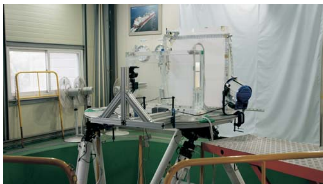
The 6-DOF motion platform with sloshing test facility

to investigate the inner flow of the water tanks and this facility is mainly used to research the behaviour of the LNGC tanks. Furthermore, there are a drop test facility and a slamming test facility (with the maximum drop height up to 4.3 m) which are used to perform wet drop experiments. A cryogenic chamber is used to investigate the characteristics of the material in extremely low temperatures. The department is also equipped with a fire test facility, an explosion test facility, a high speed impact load test facility, etc. There is also aim to install a subsea high pressure test facility in 2014, with a particular goal to perform all kind of experiments related to offshore engineering.