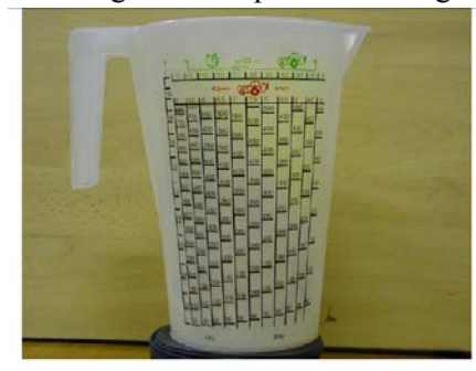
Figure 3. Cylinders used to measure the amount of flow in a nozzle

Operator has to be sure and to check all the mechanical parts for wear and to avoid troubleshoots of any faults. Most important parameters in the production of equipment is the uniformity of the nozzle, they must be cleaned and examined. Sprayers to be adjusted to the desired working pressure us in a certain unit of time (15, 30 or 60 seconds) to carry out testing nozzles capturing droplets in front of these containers, and to compare the results of all tested nozzles. In the event that the difference of water per nozzle is greater than 10%, nozzles should be replaced. Nozzles are supplies, subject to abrasion and wear, therefore, testing should be done always before the intensive use of sprinklers. Because of this and the necessary importance of safety pressure regulators, because a change of peace and change the speed of shaft revolution speed, which ultimately affects the change of pressure, and then using the same operating pressure regulator adjustments.