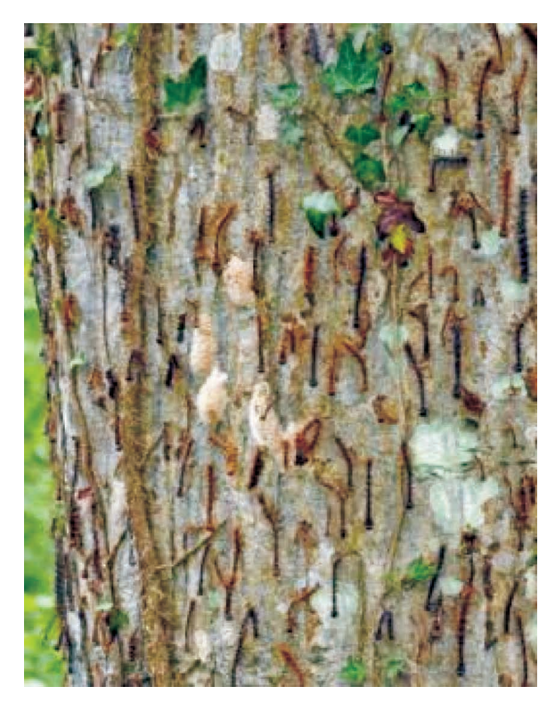
Figure 3. Masses of dead gypsy moth larvae clinging head down on a tree trunk -a typical field scene that indicated a possible presence of Entomophaga maimaiga.

Based on the size, shape and other microscopic structural characteristics of observed fungal life forms (azygospores, conidia and mycelia) and well described and known narrowness of host selectivity of the pathogen (17), it can be concluded that E. maimaiga is present in the continental Croatian gypsy moth population. Coastal gypsy moth population showed no presence of this pathogen (results not presented in this paper). Spatially scattered and dramatically high mortality of late instar gypsy moth larvae with clear and distinguishing signs of E. maimaiga attack were not obscured by the effects of wide use of B.t.k. in the area. All observed field cases of extreme mortality with typical E. maimaiga symptomatology occurred later in the season (June-July) whereas B.t.k. treatments ended in mid May. Some of the sites were not even considered for spraying due to the lower gypsy moth infestation rates. It may be argued whether