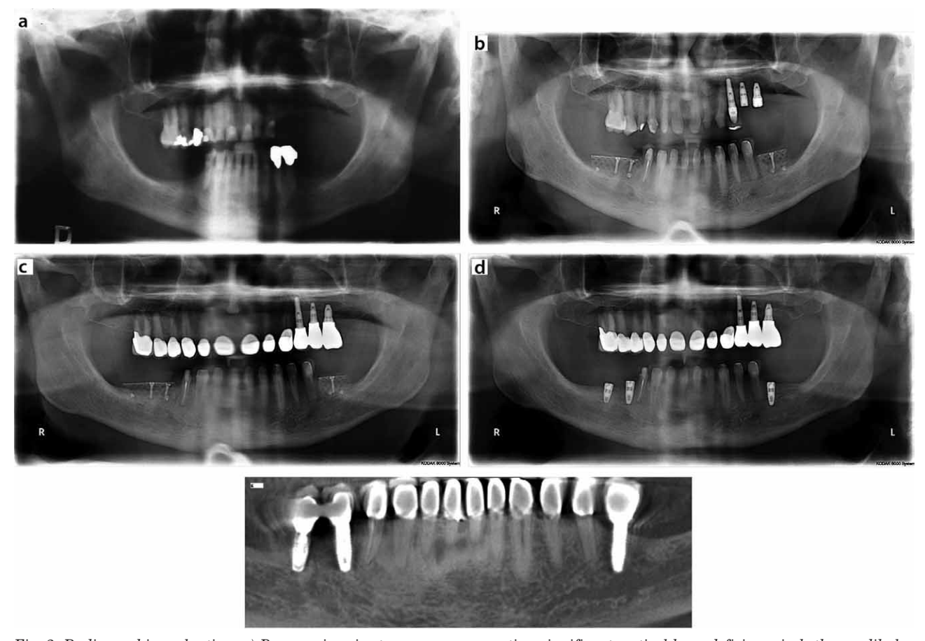
Fig. 2. Radiographic evaluation. a) Panoramix prior to surgery representing significant vertical bony deficiency in both mandibular right and left molar regions. b) Panoramix 3 months post surgery representing bone growing into space delineated by titanium membrane. c) Panoramix 6 months post surgery representing significant bone growth into space delineated by titanium membrane. d) Panoramix after placement of dental implants representing bone overgrowing the top of the implant cover screws. e) CBCT taken 12 months post surgery representing vertical gain of newly formed bone.

achieved. The bone quality was evaluated by resonance frequency device Osstell (Osstell AB, Goteborg, Sweden). ISQ values were in the range between 73 and 76 for all three implants. The surgical site was sutured using silk sutures (Mersilk, 4/0, Ethicon, INC, New Jersey, USA). Plaque control was maintained by daily rinses of the oral cavity with 0.2% clorhexidine (Corsodyl, GlaxoSmith-Kline, UK) and hyaluronic acid agent (Gengigel, Medis Adria, Italy), which were used separately 3 times a day until suture removal. Sutures were removed 10 days post-surgery. Three months following implant placement, second surgical phase was performed. Thin layer of soft tissue of fibrous consistency was noted overlying the surface of the regenerated bone which, when removed, revealed bone overgrowing the top of the implant cover screws. Healing abutments were placed for a period of two weeks after which ceramic abutments were placed on the implants, and finally restored with zirconia-ceramic restorations.