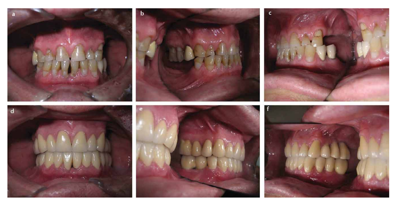
Fig. 1. Clinical findings in the 61-year-old patient pre-surgery and postoperatively.

nium implants have also been investigated in the experimental animal studies. Basic clinical research showed that newly formed bone is woven bone with vital osteoblasts and adequate vascularisation, thus representing a favorable environment for implant placement<sup>2,10–13</sup>. The safe application of rhBMP-2 has further been confirmed in human studies<sup>14,15</sup>.