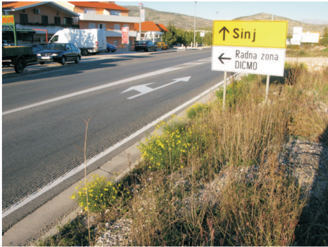
Fig. 2. The finding site of S. inaequidens in Dicmo.

On October 20, 2012, in the settlement of Dicmo, along the road opposite the Mariva coffee bar ( x=6387499 ; y=4833961 ), we found a large population of approximately 100 specimens (40-60 cm height) in ruderal vegetation (Fig. 2) in the company of the following plants: Berteroa mutabilis (Vent.) DC., Crepis foetida L., Dactylis glomerata L. ssp. hispanica (Roth) Nyman, Dichanthium ischaemum (L.) Roberty, Picris hieracioides L., Plantago lanceolata L., Sanguisorba minor Scop. ssp. muricata Briq., Silene vulgaris (Moench) Garcke ssp. angustifolia Hayek, Teucrium polium L. ssp. capitatum (L.) Arcang., etc. Plants were in the stage of full flowering and fruiting (Fig. 4, 5 and 6). The finding site is in the vicinity of the entrepreneurial zone of Dicmo. We carefully searched the whole settlement and its entrepreneurial zone, but new sites with S. inaequidens were not found. We