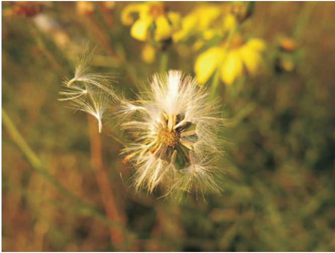
Fig. 6. S. inaequidens – fruiting capitula with ripe achenes.

Subsequently, we have repeatedly driven from Šibenik to Zadar, but new sites along the highway were not found.