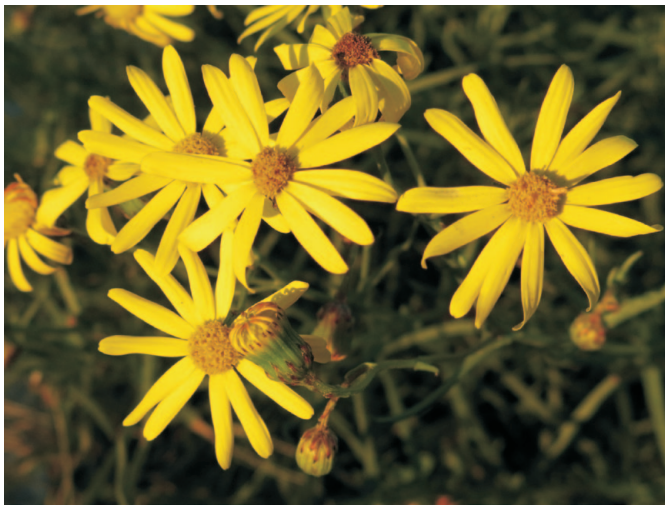
Fig. 5. S. inaequidens – flowering capitulas.

visited the same site, again on July 2 and on October 19, 2013. The population was also in the stage of flowering and fruiting but no significant change in the abundance of the population and the spread outside the original site was observed.