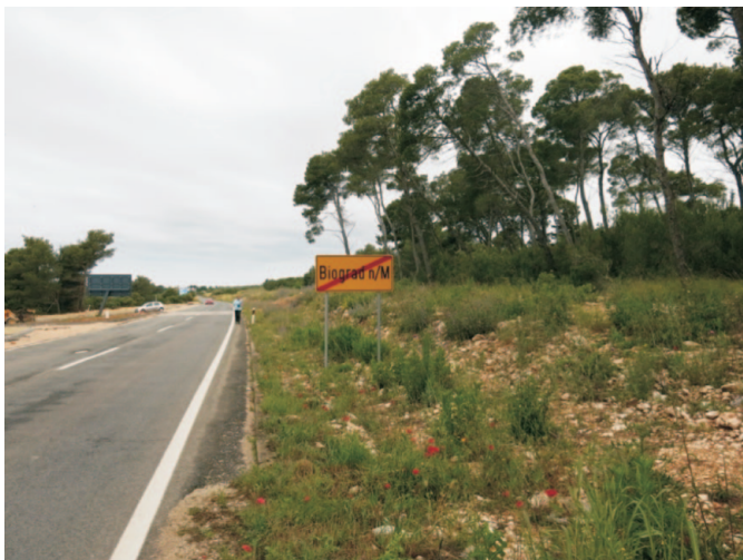
Fig. 3. The finding site of S. inaequidens near the town of Biograd.