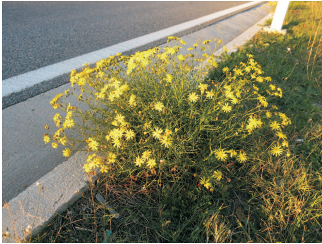
Fig. 4. S. inaequidens – habitus.