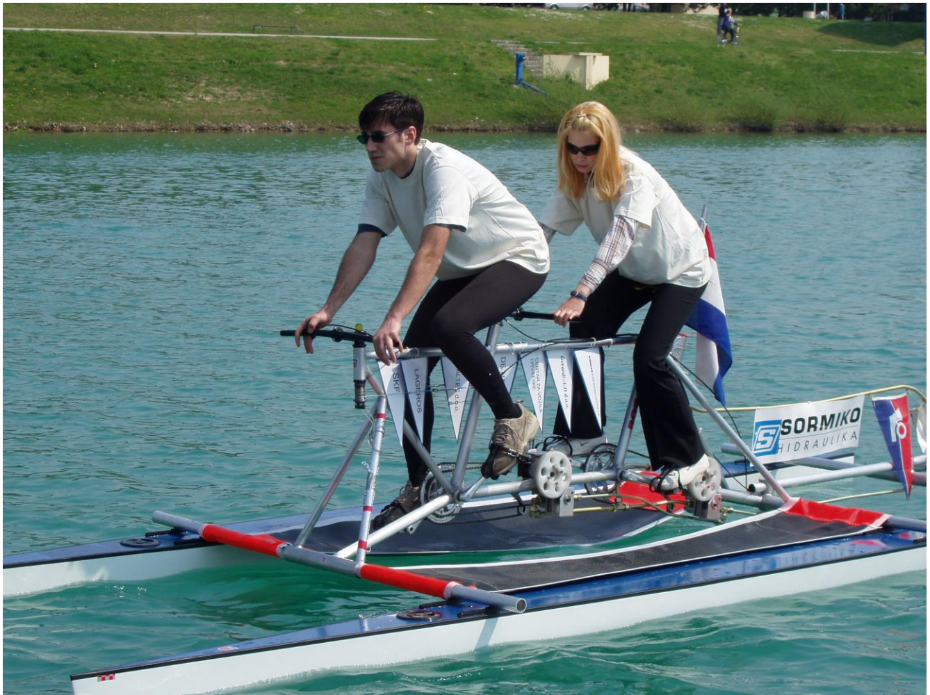
Figure 1. Hydraulically propelled waterbike