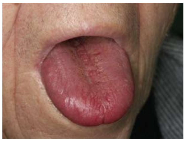
Fig. 2. Severe hyposalivation due to drug use (source: archives of the Department of Oral Medicine, School of Dental Medicine, University of Zagreb, Zagreb, Croatia).

It is known that more than 500 drugs may lead to hyposalivation. The medications which most frequently cause hyposalivation are the ones most commonly used, such as antihypertensives and psychotropic drugs. It is known that these groups of drugs cause dry mouth: antihypertensives, anticholinergics, antihistamines, benzodiazepines, cytostatics, diuretics, proton pump inhibitors and H2 antagonists, antipsychotics, antidepressants, hypnotics, opioids, muscarinic antagonists and alpha receptor agonists, appetite suppressors, bronchodilators, drugs for HIV treatment, retinoids, medications for migraine treatment, decongestants, and skeletal muscle relaxants7. Drugs can cause parasympatholytic activity in several ways, including competitive inhibition of acetylcholine at the parasympathetic ganglia and at the effector junction. Drugs may also influence parasympathetic response indirectly via interactions with the sympathetic and central nervous systems8. A patient referred to our Department with severe hyposalivation due to drug use is illustrated in Figure 2.