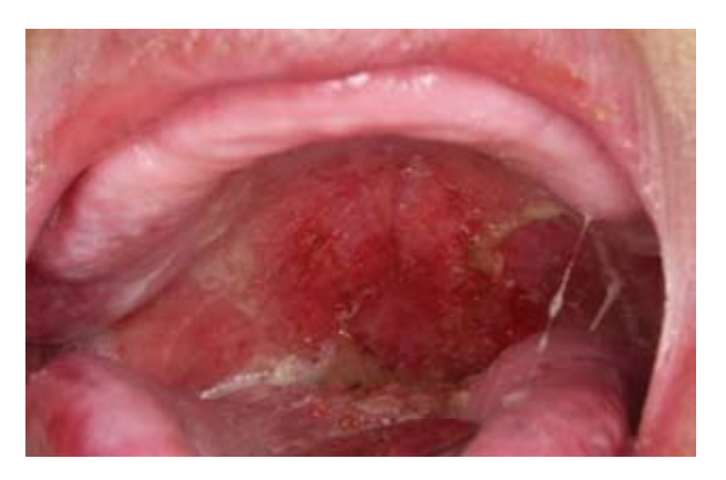
Fig. 7. Oral mucositis due to 5-fluorouracil (source: archives of the Department of Oral Medicine, School of Dental Medicine, University of Zagreb, Zagreb, Croatia).