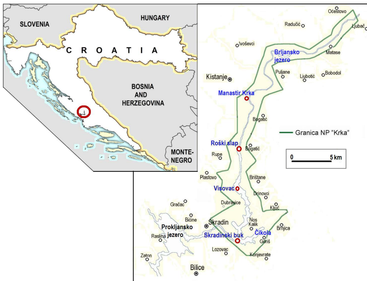
Figure 1. Geographical position and boundaries of the Krka National Park.

The most recent field research conducted in the period from 2010 to 2015 resulting in a significant number of new records of vascular plants for the Krka National Park is presented in this study.