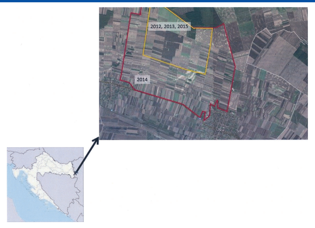
Figure 1. The location of area-wide program in the Vukovar-Sirmium region and map of the mass trapping area from 2012 to 2015.

were grouped according to field size into three groups: less than 6 ha in size, between 6 and 59 ha, and over 60 ha in size.