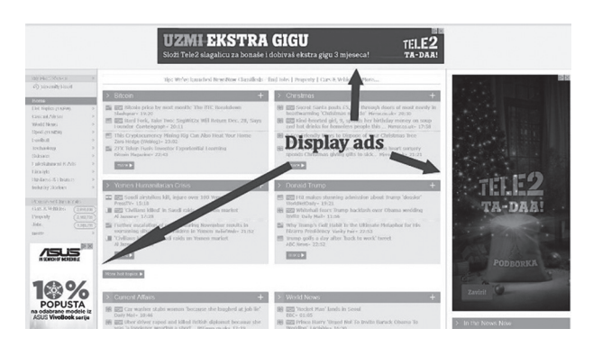
Fig. 2. Example of a display ad

According to [4], display advertising is a digital version of jumbo posters or TV ads, and it is used for websites users visit. Companies pay inventory to attract as many potential customers as possible. There are two ways to do that, i.e. by buying ad space from the website owner or by using affiliate networks for companies with different sites promoting ad slots. An ad can be displayed on specific web pages, to an individual website visitor, or both. Like other digital lithographic forms, display advertising platforms offer many options for targeting users. One of the options is to show your ad to the specific speaking area or at a particular time of the day. For example, it is possible to have an exact selection of ad placements by selecting a specific website or specific areas on that website where the ad can appear. Display advertising has many options in defining ad layout. For example, banner ads come in all shapes and sizes, video ads use motion and sound, while Gmail ads are interactive and expandable ads at the top of a user's inbox. An ad banner example is shown in Figure 2.