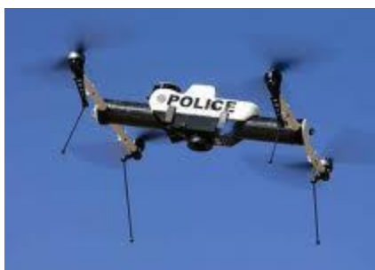
Figure 1: A Law enforcement UAV [4]

Mohammed et al. discuss the applications of unmanned aerial vehicles (UAVs) in smart cities, their opportunities and their challenges in their paper.[4] They wrote about various UAV applications in cities which include monitoring traffic flow to measuring and detecting floods and natural disasters by using wireless sensors. They also explain challenges and issues of UAV usage such as safety, privacy and ethical uses. Figure 1. shows a Law enforcement UAV used in police activities. They conclude that integrating UAVs with smart cities will create a sustainable business environment and a peaceful place of living. And that UAV systems and smart cities can significantly impact and benefit any country when used effectively and efficiently.