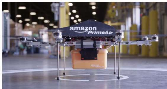
Figure 2: Amazon Prime Air – UAV for package delivery [18]

When Amazon first unveiled its UAV, dubbed the Prime Air Drone, it showed off an octocopter with eight rotors. It weighed 25kg and could carry up to 2.26kg at speeds of 80kph. However, the latest UAVs designed by Amazon are smaller with no fixed wings. They actually appeared very different from the original drones, which were more massive with fixed wings. [12] One of the Amazon UAVs is showed on Figure 2. In 2017 Amazon has received a patent for a shipping label that includes a built-in parachute, to enable the delivery of packages by UAVs or other aerial vehicles. [5] They still didn't put it in use but this move announces the expansion of UAV use for commercial purposes.