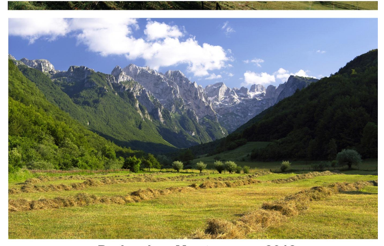
Podgorica, Montenegro, 2018