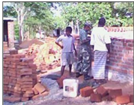
Construction works conducted by Army troops (Sri Lanka Army, 2012)